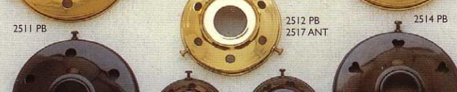
2511 PB 2512 PB 2514 PB 2517 ANT