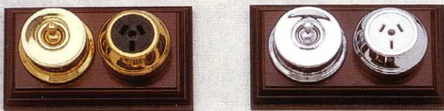
EXAMPLES OF SWITCHES & SOCKETS ON SWITCH BLOCKS.