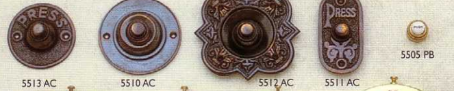
5513 AC 5510 AC 5512 AC 5511 AC 5505 PB