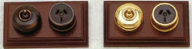
EXAMPLES OF SWITCHES & SOCKETS ON SWITCH BLOCKS.