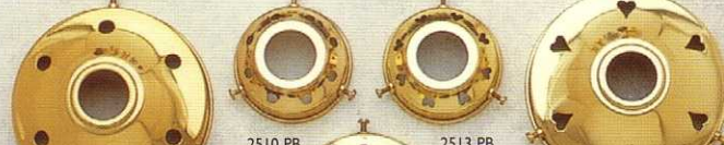
2510 PB 2513 PB