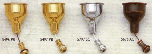
5496 PB 5497 PB 5797 SC 5696 AC