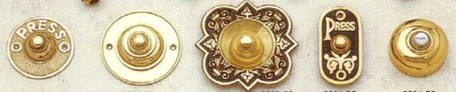
5503 PB 5500 PB 5502 PB 5501 PB 5506 PB