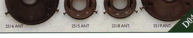
2516 ANT 2515 ANT 2518 ANT 2519 ANT