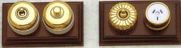
EXAMPLES OF SWITCHES & SOCKETS ON SWITCH BLOCKS.